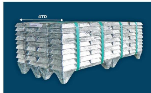
Physical Specifications : All Dimensions in mm